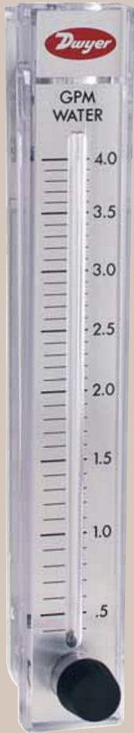
Model RMC-SSV 10" scale, 15-3/8" high

Polycarbonate Gas Flow from 0.05-1800 SCFH, Water Flow to 10 GPM