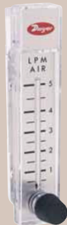
Model RMA-SSV 2" scale, 4-13/16" high